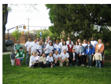
The 2009 Team Credit Suisse had 40 walkers!

A company reaps numerous benefits when participating as a corporate team for Great Strides. It increases employee morale and provides leadership opportunities through a team building experience. By participating in a well-structured event like Great