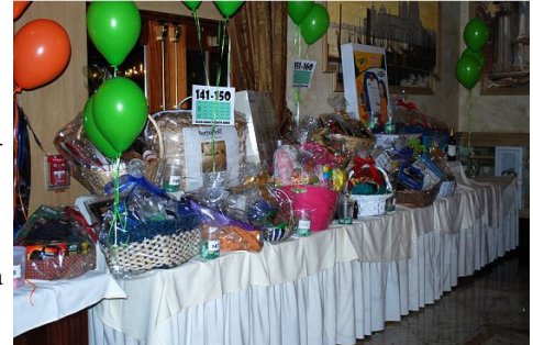
The 2009 Fall Fling gift auction room.

Don't miss next year's Fall Fling scheduled for Thursday, October 21, 2010.