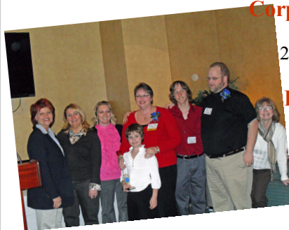
The Donoghue Family